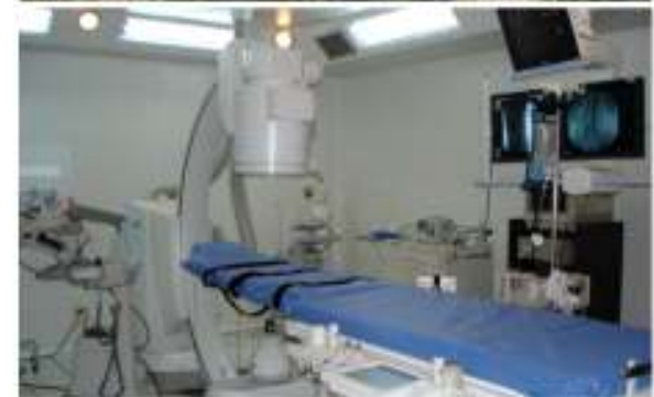
Cali – Clinica de Occidente